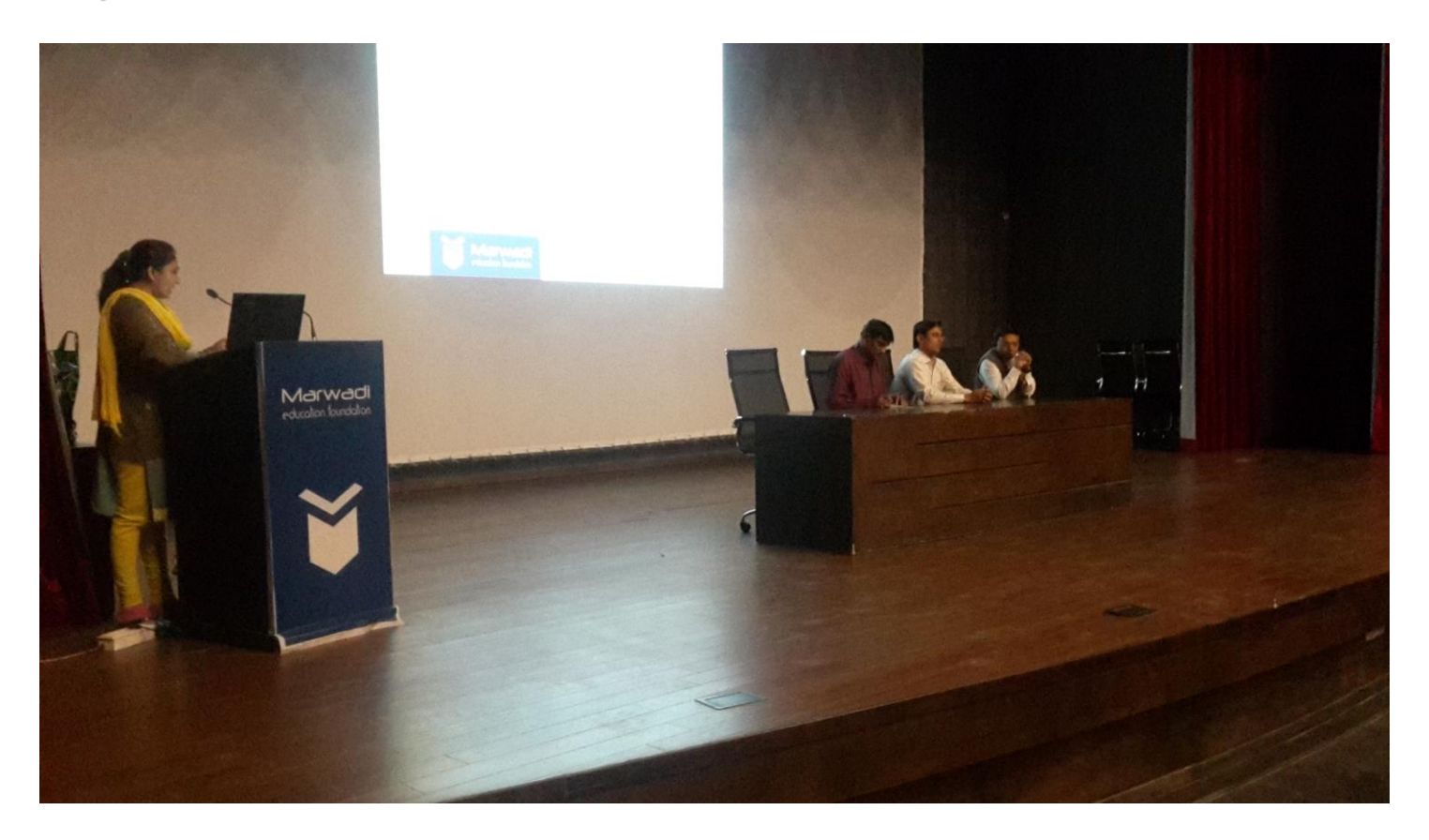
Photograph of ongoing seminar