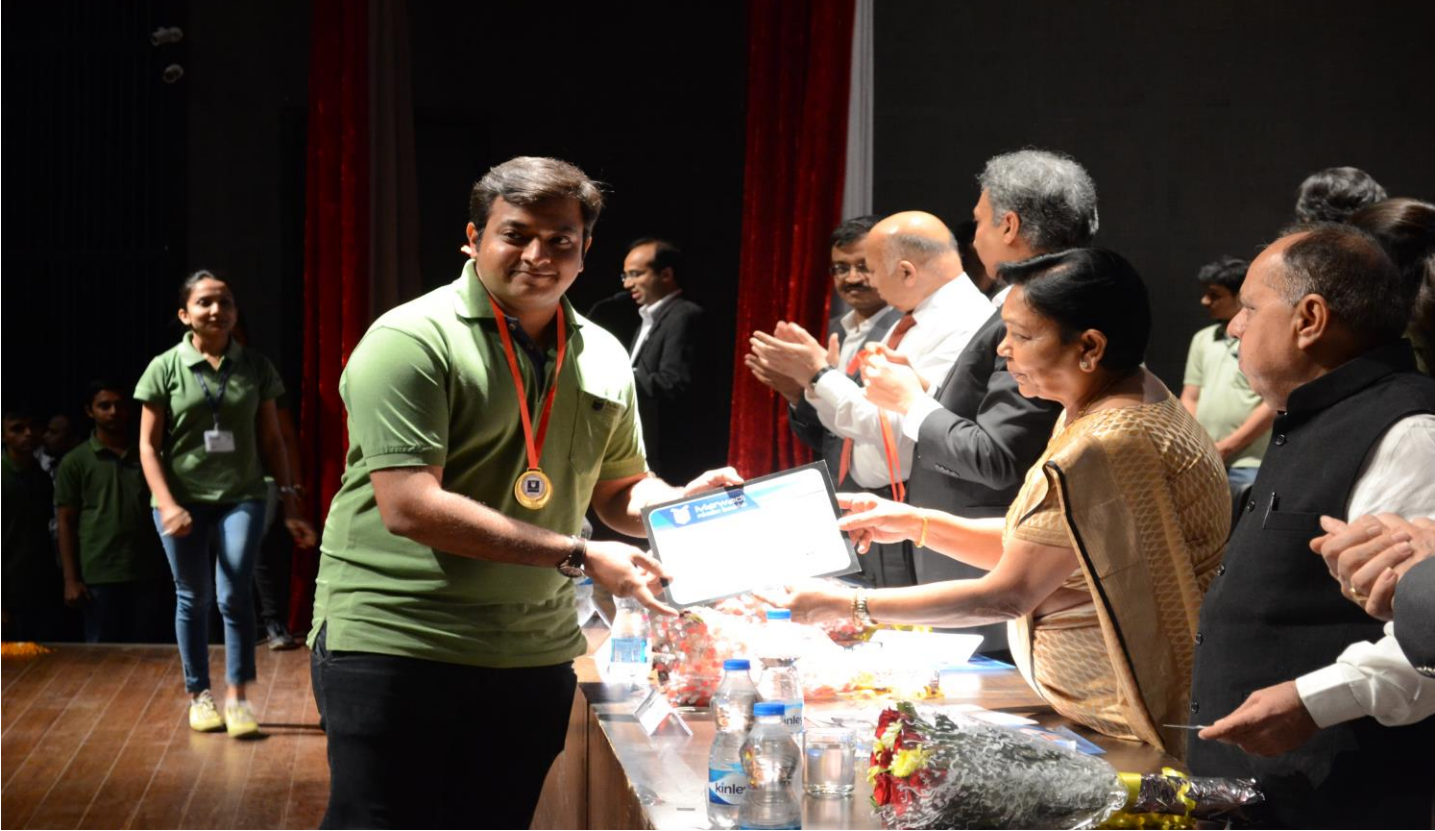
Published by: Civil Engineering department Marwadi Education Foundation Group of Institutions, Morbi road, Rajkot Tel. (0281) – 2923112 | www.marwadieducation.edu.in