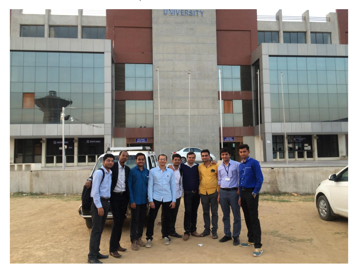
A glimpses of Marwadi students standing in front of GTU, Chandkheda

Students of Post-Graduation study, went to GTU, Chandkheda for dissertation work.