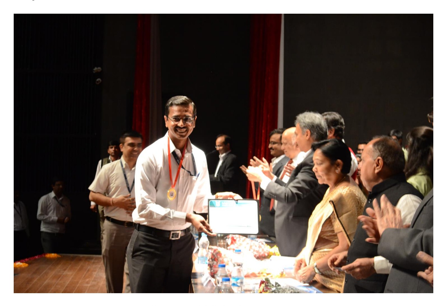
Glimpses of felicitation ceremony