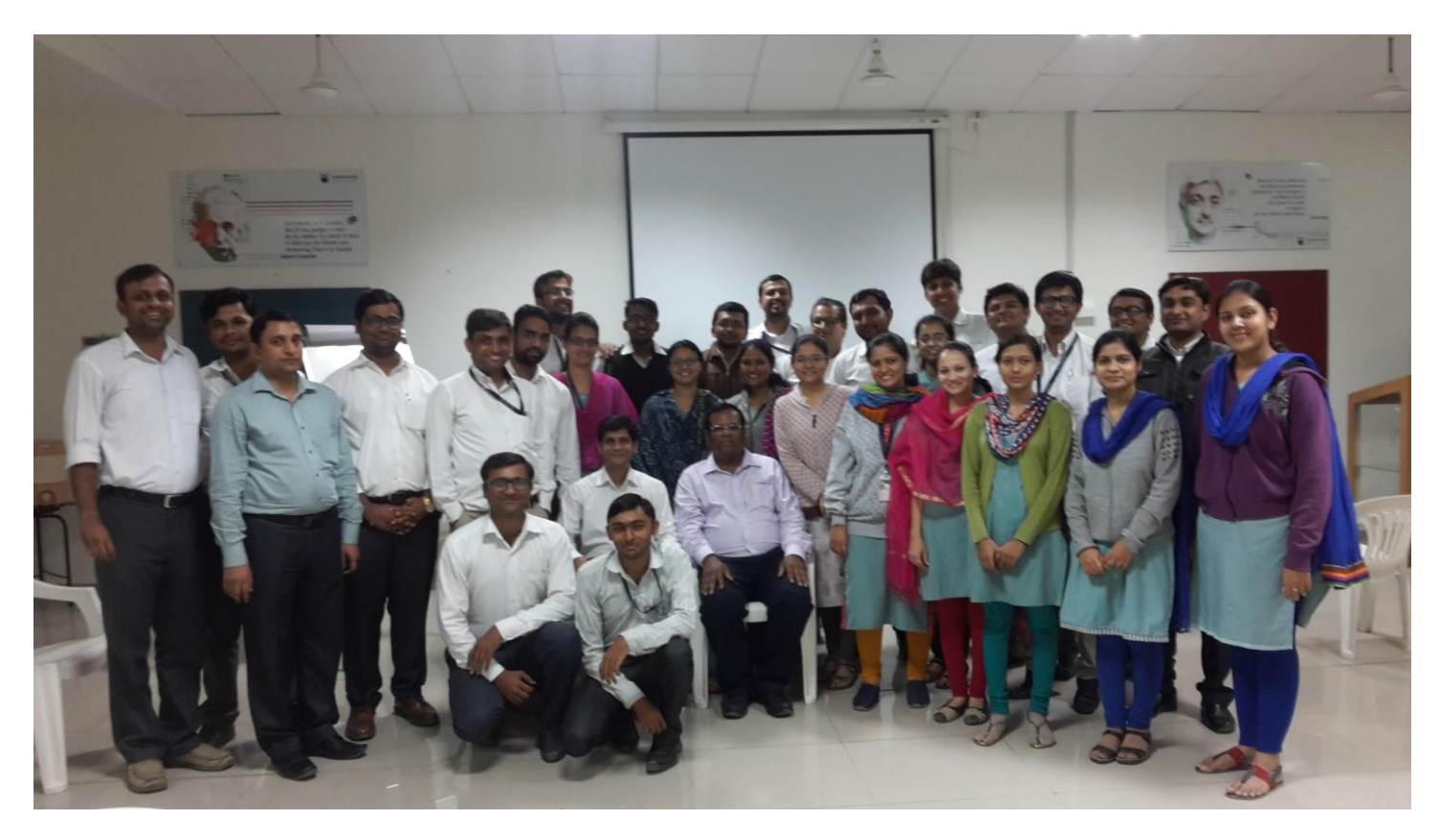
Glimpses of faculty members participated in WIPRO 10X Engineering FDP

Faculty development program was conducted by WIPRO in order to brush up the teaching skills, sessions include innovative ideas and skills of teaching, so that one can easily communicate with students and can deliver best of what they have. This program helps faculty to break iceberg and solitude with students which helps them to reduce communication gap with student. Faculties of civil engineering department actively participated in this development program.